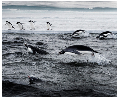
D ADELIE PENGUIN