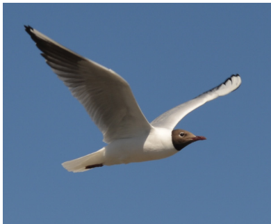
E ARCTIC TERN