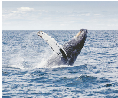
B BLUE WHALE